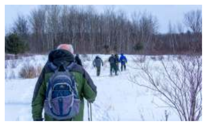
Here follow descriptions of the day from two of the bog Walkers:

road Trail parking lot where an introduction to bogs in general and Maquam Bog in particular was given. Then is was on with the snowshoes and off to the bog.