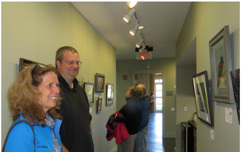
May 17th Artists Reception at the Visitor's Center