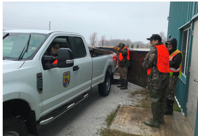
Refuge Staff and Volunteers enjoyed a rainy morning cleaning up along Route 78, the Missisquoi River, and Cabot Marsh as part of Vermont's annual Green-Up Day efforts.