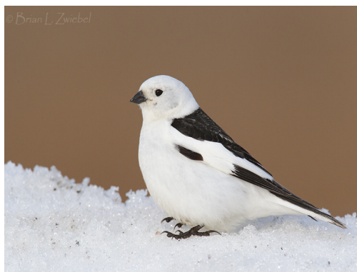
Snow Bunting – Summer plumage