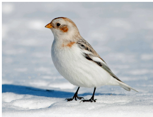
Snow Bunting – Winter plumage

Spring migration, in all of its glory, again reminds me that the birds we're seeing and enjoying aren't just “our” birds. Instead, we share them with many other people and places on the planet. Some of these birds, literally, are here today and gone tomorrow, doing what they came to do, and then moving on. So wherever you are, enjoy the northward-bound messengers of spring...and their sweet songs of warmer days to come.